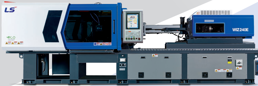
Full Servo-Driven Electrics WIZ-E